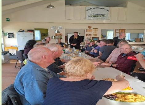
Shot glasses were supplied and the contemplation continues