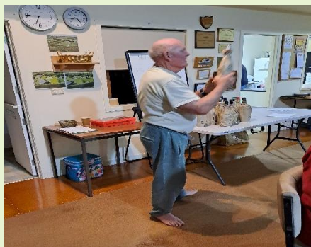
The Auction starts