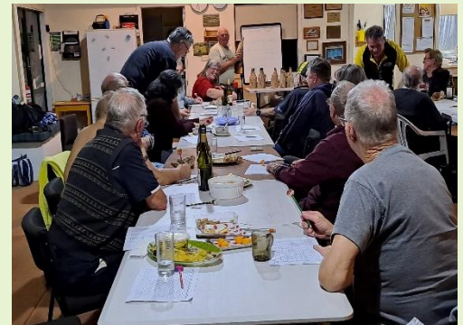
The auction continues.....