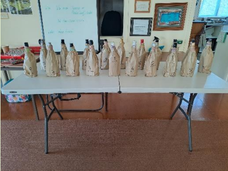
19 green bottles sitting on a table