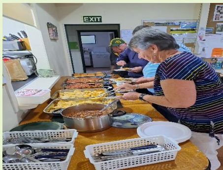
Dinner is served